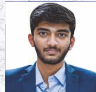
CHIEF GUEST D GUKESH WORLD CHESS CHAMPION (VELAMMAL ALUMNUS)